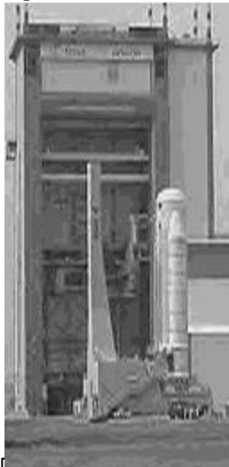
The Flight 135 Ariane 5 launch vehicle arrives at the Final Assembly Building, where the payloads will be mated to the launcher.